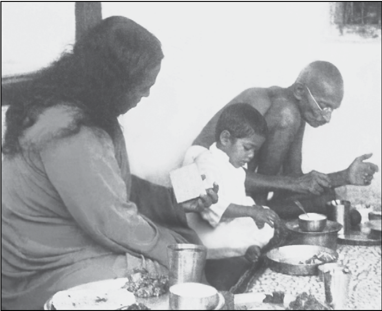
Paramahansa Yogananda and Mahatma Gandhi Wardha, India, 1935

We hope you will help to strengthen this healing tide with the soul-force of your prayers. Prayer services are held at Yogoda Satsanga/Self-Realization Fellowship ashrams, kendras, and mandalis. If you are unable to attend these services, or if you are a follower of another spiritual teaching, you may wish to have a private service each week in your own home (see instructions on page 20). As mentioned earlier, the basic principles of prayer and healing described in this booklet are applicable by anyone, regardless of religious affiliation.