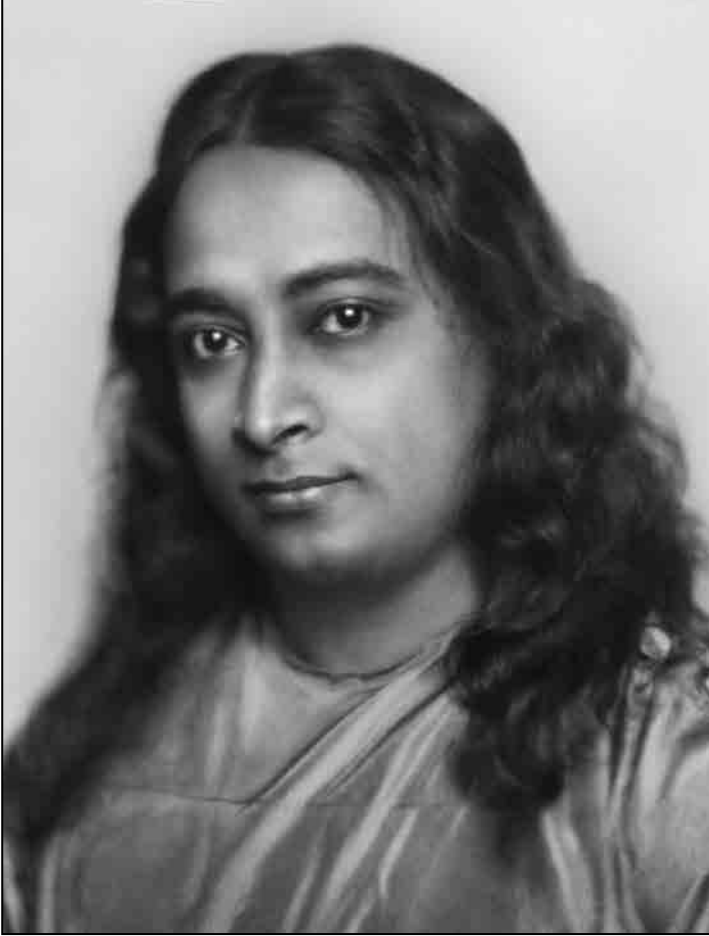
SRI SRI PARAMAHANSA YOGANANDA (1893-1952)